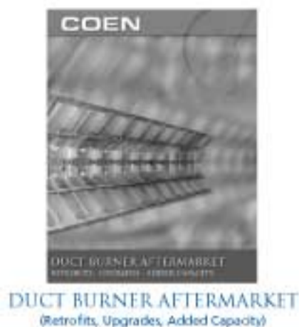
DUCT BURNER AFTERMARKET (Retrofits, Upgrades, Added Capacity)