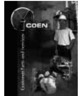
CUSTOMER PARTS & SERVICES