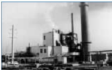
PROCTER & GAMBLE MEHOOPANY, PA

When Procter & Gamble needed to increase production at their Mehoopany, PA plant, it required an increased steam load at reduced emissions to meet overall umbrella emissions requirements of local air quality standards. To minimize downtime, this required quick turnaround retrofitting of three boilers, to operate at lower overall emissions with the latest state of the art combustion technology. In addition to reliable burner equipment, P&G needed a comprehensive turnkey retrofit to insure a seamless installation. P&G selected Coen's retrofit team to provide sole source accountability for the entire turnkey project, from removal of existing material to installation and commissioning of the new equipment.