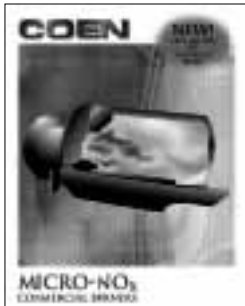
MICRO-NO x (Commercial Burners)

ASK YOUR COEN REPRESENTATIVE FOR COPIES OF OUR LATEST BROCHURES!