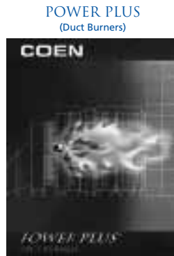
POWER PLUS (Duct Burners)