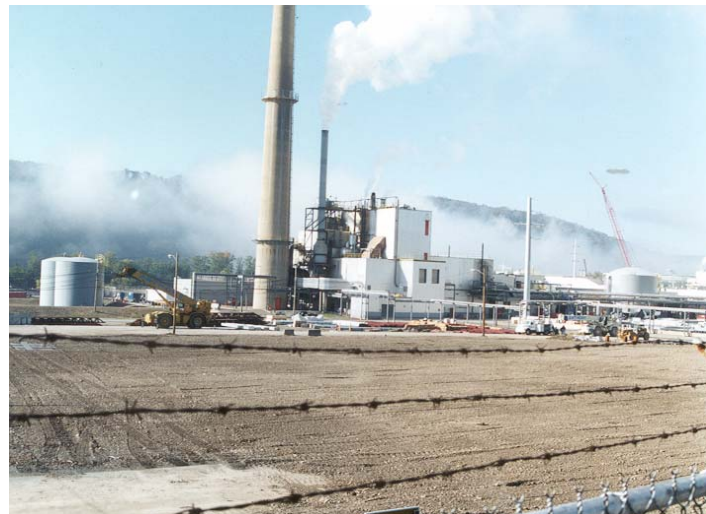
Procter & Gamble Mehoopany, PA