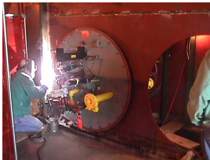
Installation of Coen Low NOx Burners