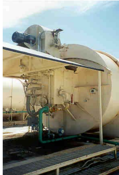
Coen QLN Burners For Steamers

The primary benefit of the new "QLN" burner is that it doesn't require flue gas recirculation . One can avoid the added expense of a separate FGR fan or a larger primary air fan to induce FGR (some steamers use 75 HP fans). FGR operating horsepower cost, loss of thermal efficiency, and the installation and maintenance of an FGR system is eliminated.