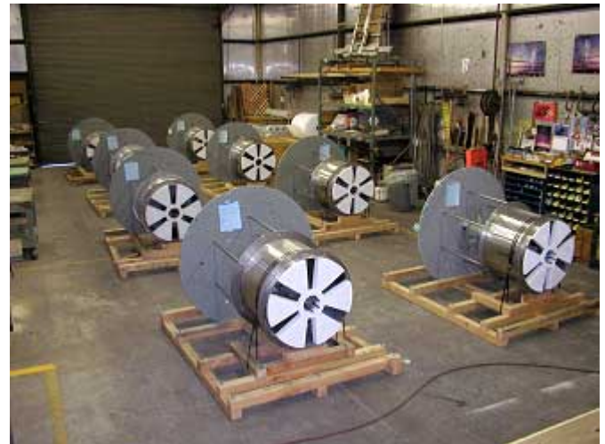
Shipment of First Two Sets of Coen QLG Burners

Coen engineers employed Computational Fluid Dynamics (CFD) modeling to optimize the distribution of combustion air and flue gas recirculation (FGR) to the windbox.